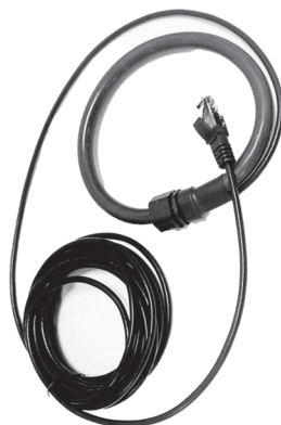
Lindsey LEA Rogowski Coil Current Sensor

Various relay manufacturers, are offering relays compatible with Low-Energy Analog (LEA) sensors. LEA current sensors provide excellent linearity, a wide dynamic range, and often reduced size and weight. Most Lindsey voltage sensors for the past 40+ years have always been LEA designs internally. Lindsey's new LEA voltage sensor products are specifically tailored to interface to relays following the IEEE C37.92 and IEC