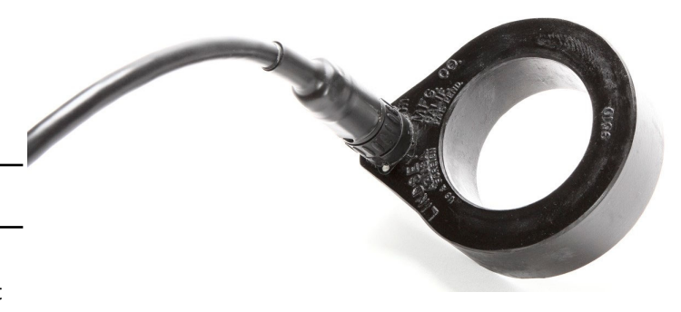
Split-core CT: P/N 9520/101X